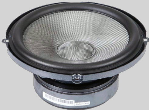
Infinity Kappa 60.9 CS 2 ohm, 90 watts RMS, 95dB

I got my 6 with the cheap crappy loudspeakers and that it is torture so I changed the speakers to the Bass from a KAPPA 60.9 CS and a Panasonic tweeter EABST15. I made some fittings out of plywood for the 6,5" speaker so they would fit into the doors. The tweeter from the Kappa set was too big so I got the Panasonic instead this could easily be so it would fit into the place where Mazda had mounted the original tweeter.